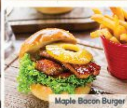
Maple Bacon Burger