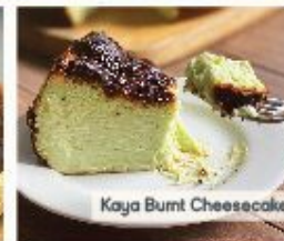
Kaya Burnt Cheesecake