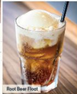
Root Beer Float