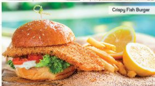
Crispy Fish Burger