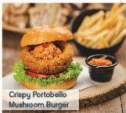
Crispy Portobello Mushroom Burger

🍄 Crispy Portobello Mushroom Burger $17 Crumbed portobello, sundried tomato with olive sauce, aioli