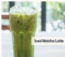
Iced Matcha Latte