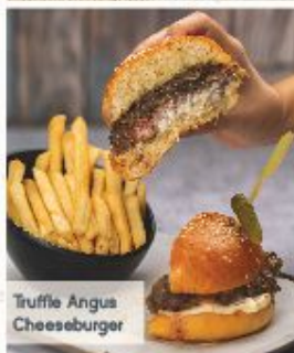
Truffle Angus Cheeseburger