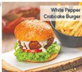
White Pepper Crabcake Burger