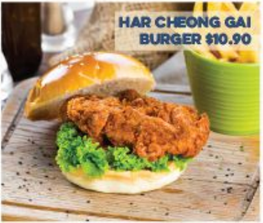
HAR CHEONG GAI BURGER $10.90