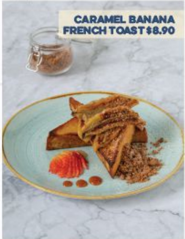
CARAMEL BANANA FRENCH TOAST $8.90