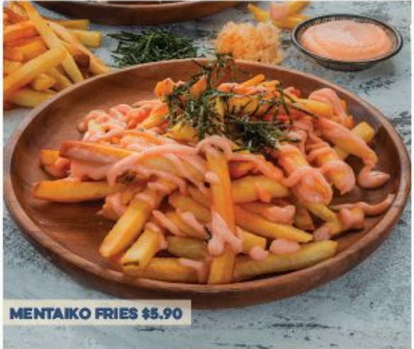
MENTAIKO FRIES $5.90