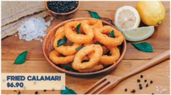
FRIED CALAMARI $6.90