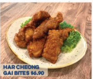
HAR CHEONG GAI BITES $4.90