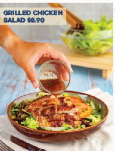
GRILLED CHICKEN SALAD $8.90