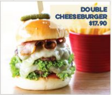
DOUBLE CHEESEBURGER $17.90