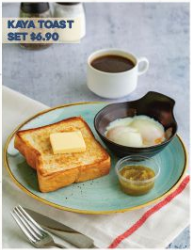
KAYA TOAST SET $6.90