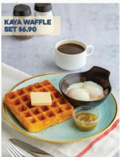
KAYA WAFFLE SET $6.90