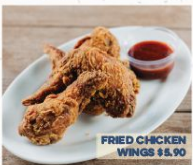
FRIED CHICKEN WINGS $5.90