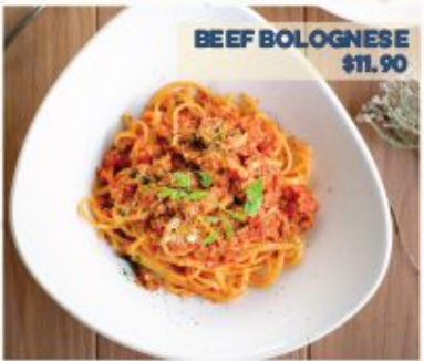
BEEF BOLOGNESE $11.90