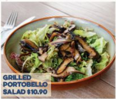
GRILLED PORTOBELLO SALAD $10.90