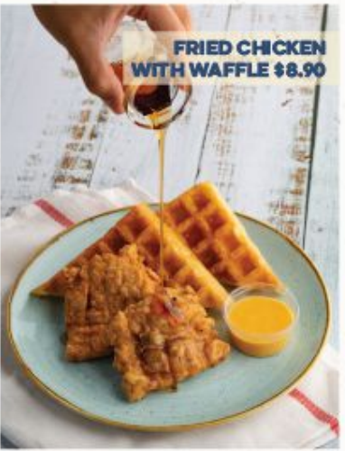
FRIED CHICKEN WITH WAFFLE $8.90