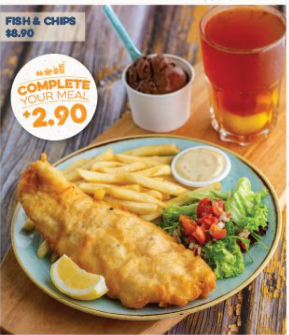
FISH & CHIPS $8.90