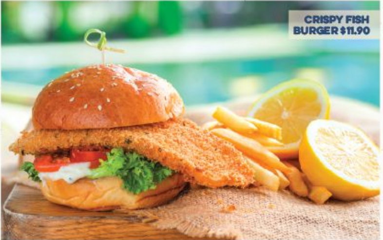
CRISPY FISH BURGER $11.90